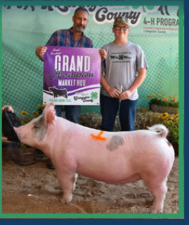
Consignor: Reid Shutt Buyer: Edgewood Farms, LLC