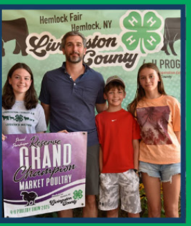
Consignor: Isabella Fischer Buyer: Farm Credit East