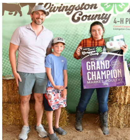
Consignor: Kiara Gramkee Buyer: Farm Credit East