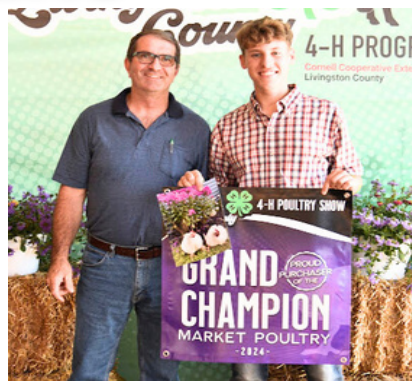
Consignor: Brady Wood Buyer: Vonglis Enterprises, LLC